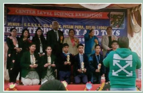
First Prize at Central Level Science Exhibition