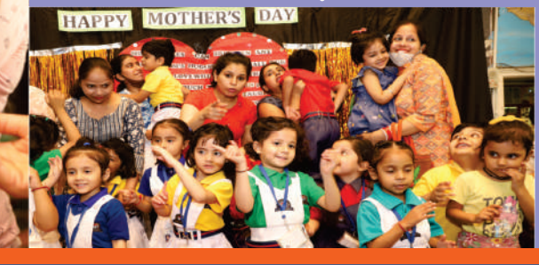
"You don't have to be great to start, but you have to start to be great."

mother, the reason, source of our existence One of the greatest traits a mother can have is selflessness. Our Gratitude week could never be accomplished without expressing our love and respect for our beloved mothers. Little Divinians exhibited their immense love and gratitude by crafting photo frames for their mothers. Each photo frame was special and different in its own way.